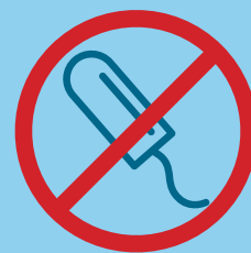
Feminine hygiene products