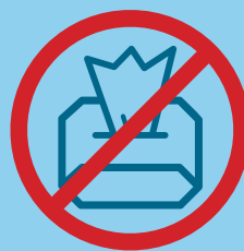
Wipes (Baby or flushable)