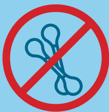
Cotton (Cotton swabs or balls)